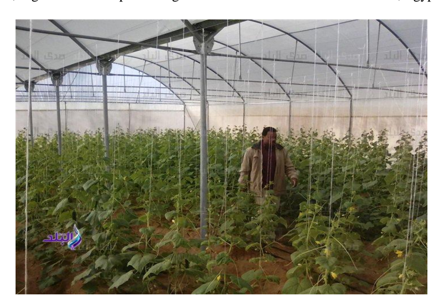
Figure 3. Solar-powered greenhouse at a school in Dakhla Oasis, Egypt

In Egypt, the National Company for Protected Cultures is establishing 100 thousand greenhouses, including five thousand greenhouses as the first phase in the areas of El-Hammam, Abu Sultan and the Tenth of Ramadan and the village of Hope in Sinai east of Ismailia. The project aims to expand the cultivation of various strategic crops, vegetables, fruit, and others and rationalize the use of available water resources and maximize the return on investment by applying modern scientific methods. The use of greenhouses for some crops is achieved by rationalizing the use of irrigation water for open crops by 50% in the regular greenhouses with a threefold increase in productivity, while high-tech greenhouses achieve 90% irrigation water, with an increase in productivity equivalent to six times the productivity in the same area of open crops, as well as working to increase the supply of different vegetable varieties in the market for citizens at appropriate prices throughout the year. In continuous, Fig 3 show solar-powered greenhouse at a school in Dakhla Oasis, Egypt.